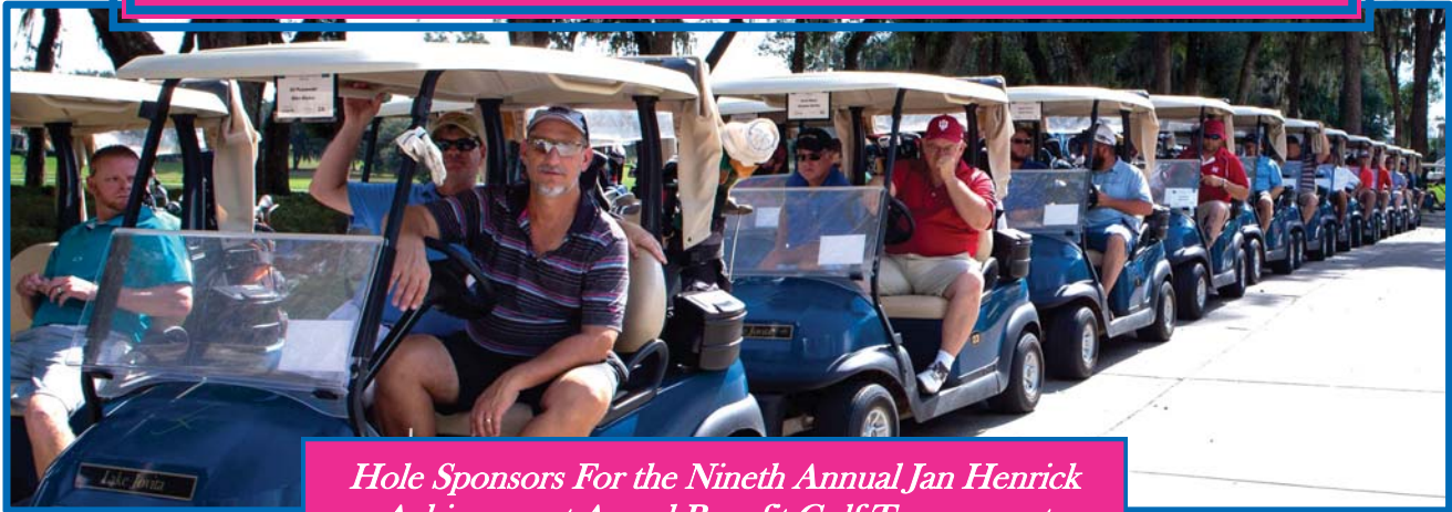
Hole Sponsors For the Ninth Annual Jan Henrick Achievement Award Benefit Golf Tournament